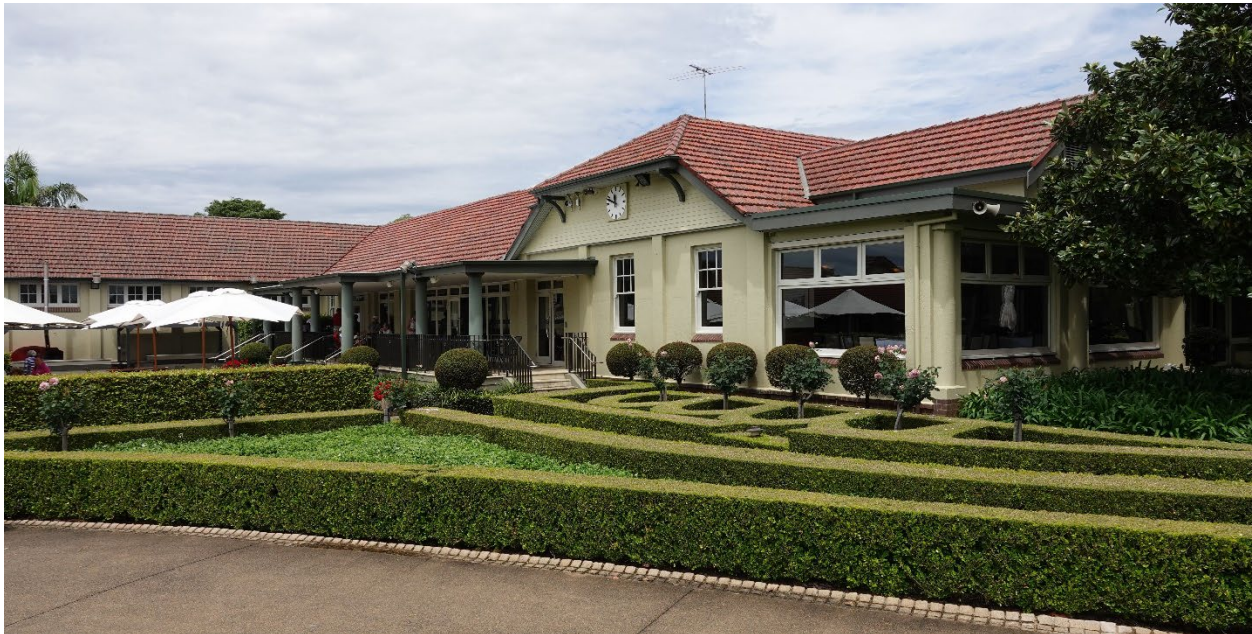
The Concord Clubhouse.

A leisurely start this morning, arriving at Concord Golf Club about 11 o'clock.