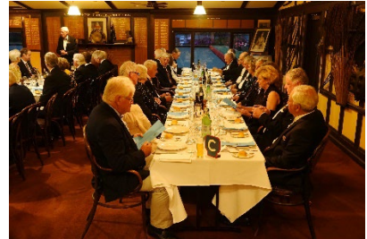
The West Brighton Club

This was a wonderful meal, worthy of such an occasion.