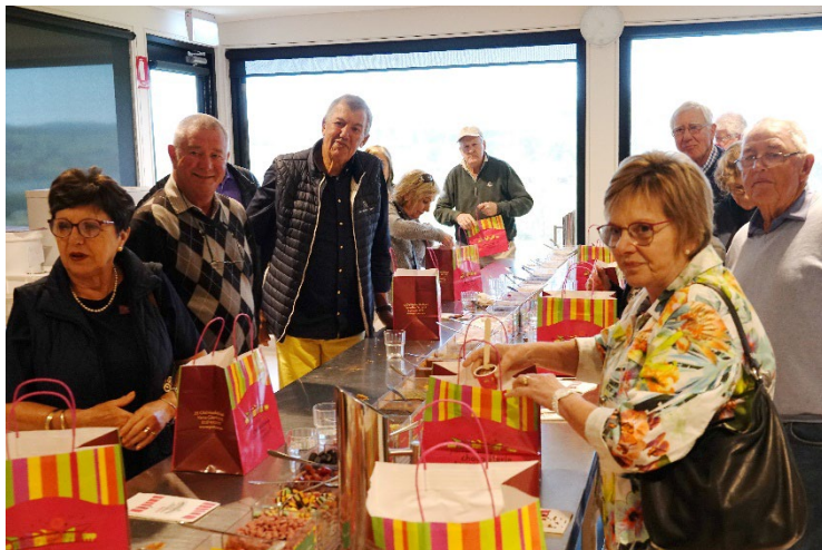
In the Rocky Road Mixing Room

Our first visit was to the Yarra Valley Chocolaterie and Ice Creamery.