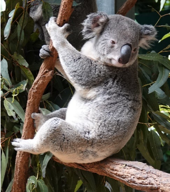
A rescued koala

We caught the cruiser for the return trip back and arrived at our hotel about 4.00pm.