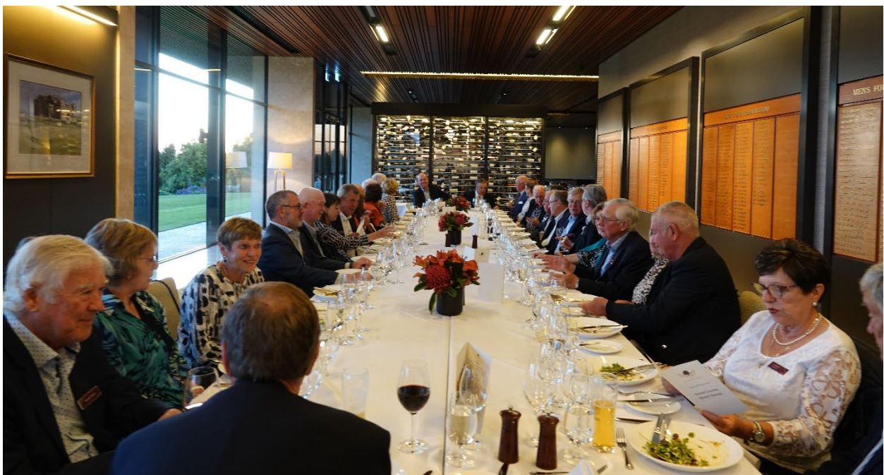
Lunch in the beautiful clubhouse that has large vistas of the course.

We were met by the Senior golfers and some wives and after a light lunch, we all teed off from 1.00pm.