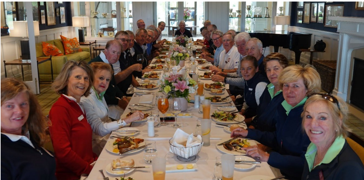
We were treated to a superb buffet lunch, which set us up for the match.