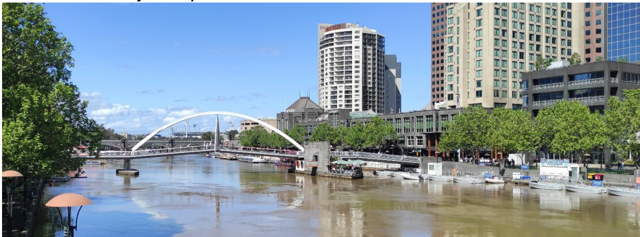
Melbourne and the Yarra river, AND Blue Sky!

Everybody was up early, to catch the bus for Brisbane Airport and our flight to Melbourne. Once we found our way to the Group Bookings counter the remainder of the journey was uneventful.