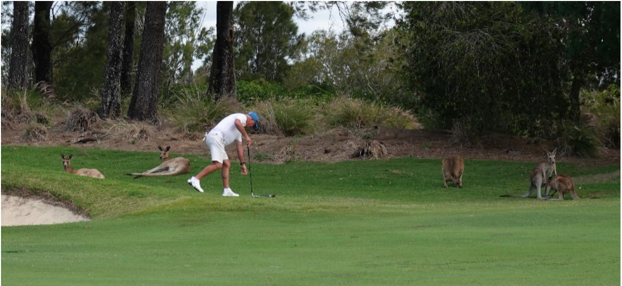
Wessel & local company.

The men encountered a number of spectators but they didn't appear to be very impressed by the golf and just continued either grazing or dozing.