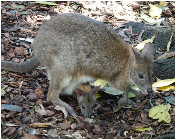
A Red-necked Pademelon and Joey

Most of the players managed to play and the Australian Seniors had arranged for the non-players to visit the Featherdale Wildlife Park a short distance away.