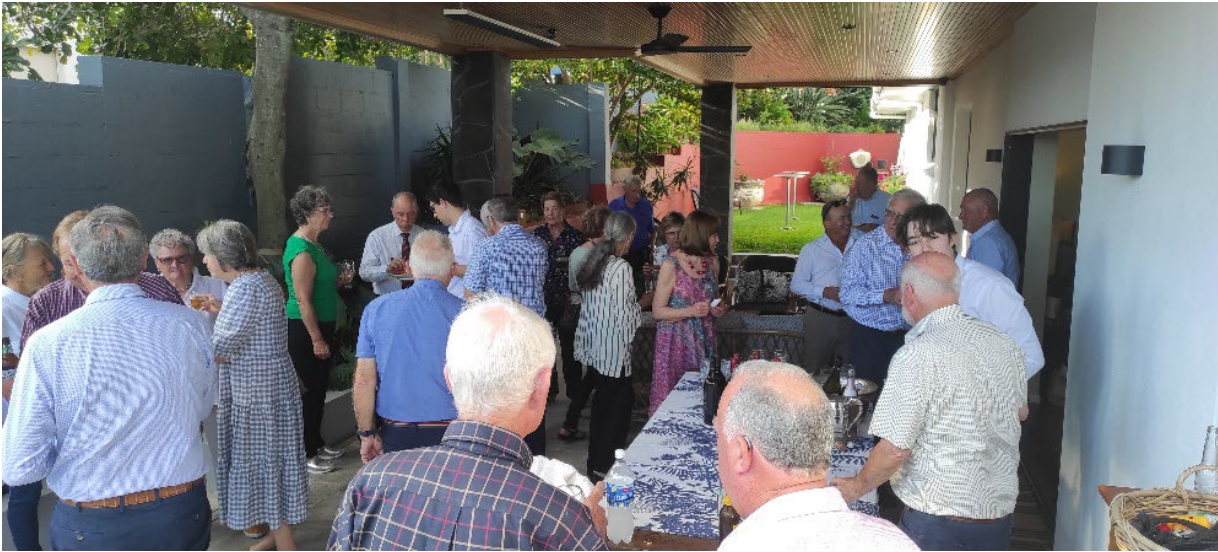
We were completely spoilt, with wonderful company and plenty of canapés and refreshments.