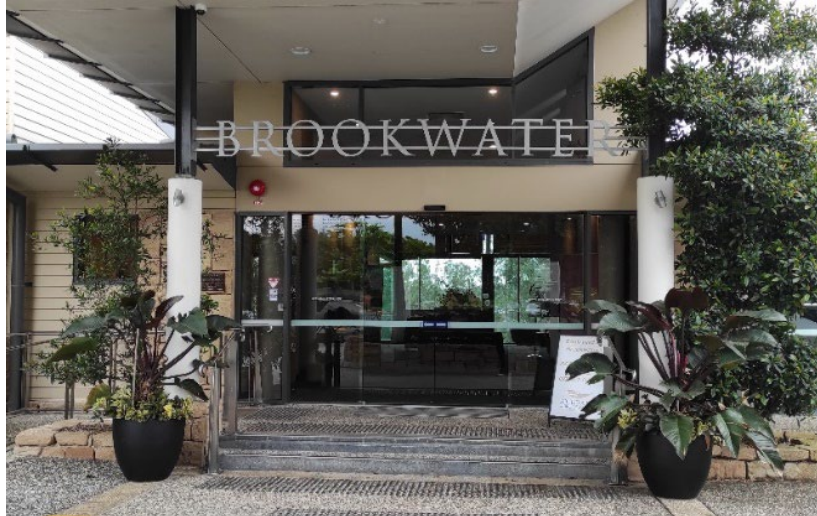
Brookwater GC Entrance.

An early start for the golfers, fortified with a good breakfast, left by coach for Brookwater Golf Club.