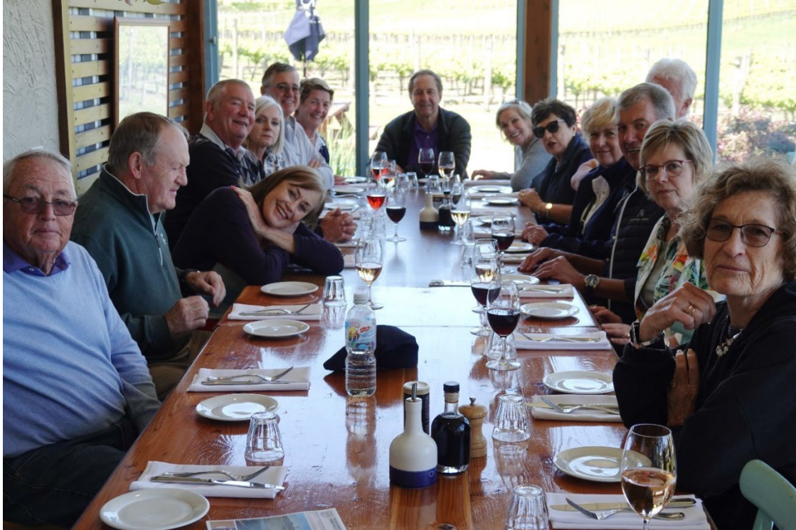
Happy faces at Soumah Vineyard

Next it was onto the wine tasting, firstly at Soumah of Yarra Valley where we also enjoyed an al fresco lunch and an opportunity to buy some of their wines.