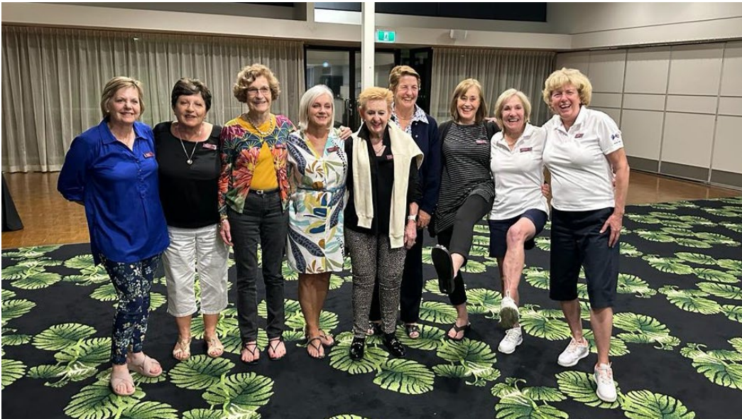
The SA Ladies