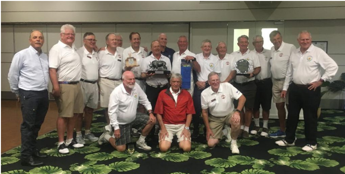
The SA team and their hosts after a day of golf