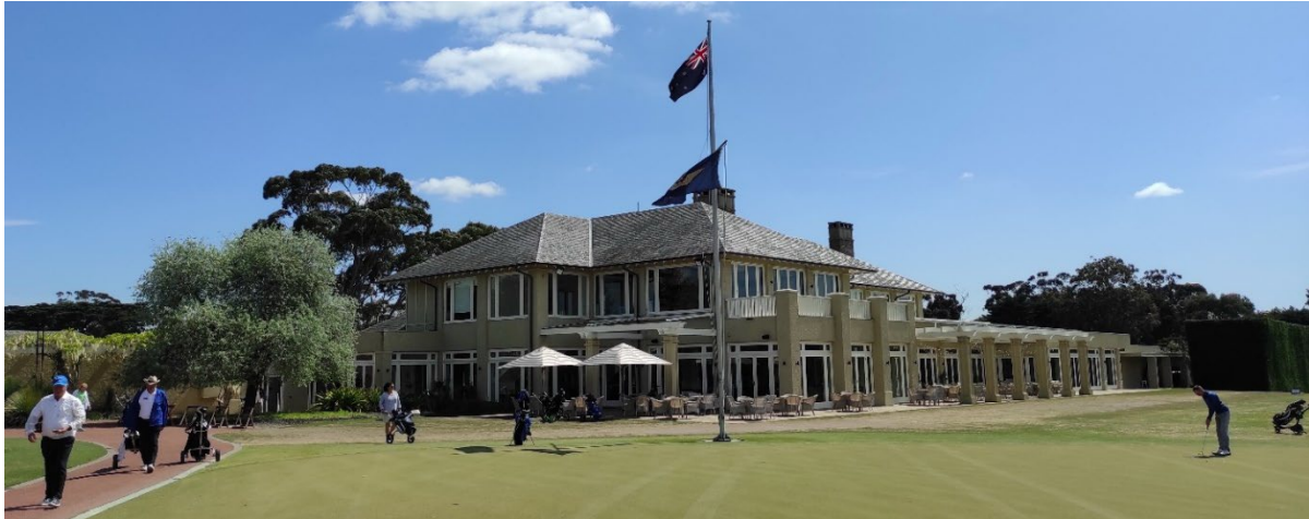
Royal Melbourne Golf Club, what a beautiful setting, stunning clubhouse, with plenty of memorabilia.

This morning we had a leisurely start, with a late breakfast before our start at 11.00am. A coach ride to Royal Melbourne Golf Club in the morning sun. The West Course is rated No.1 in Australia and in the top 5 in the World.