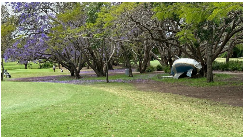
The sad end of “Miss Frelove” stranded after the March floods