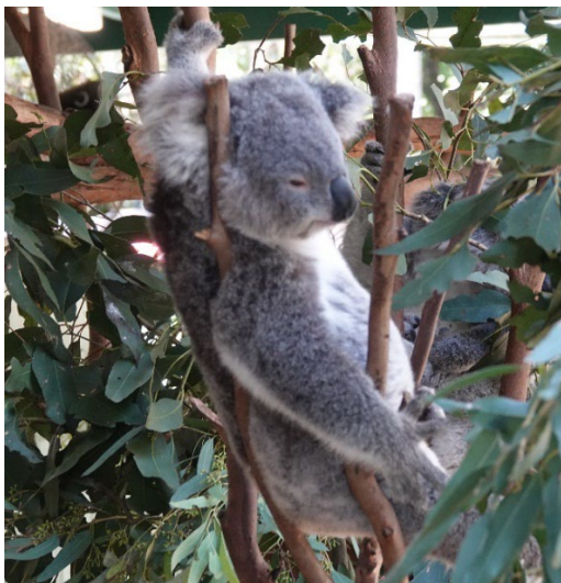
Laid back Koala