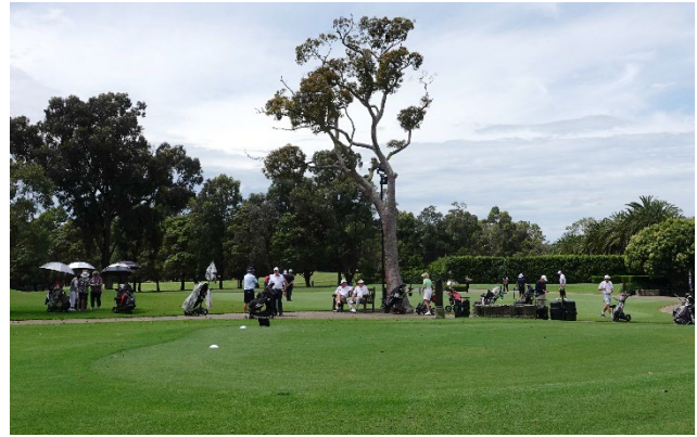
The 1 st tee at Concord GC

Most of the players managed to play and the Australian Seniors had arranged for the non-players to visit the Featherdale Wildlife Park a short distance away.