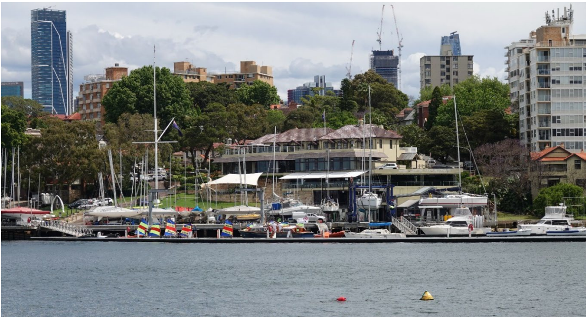
Royal Sydney Yacht Squadron

Later, we were picked up by our coach for a tour of Sydney, which was quite an eye opener, so many skyscrapers, and high-rise buildings, not only company offices, but accommodation as well, when you see the views, you can understand why everyone wants to be near the Harbour.