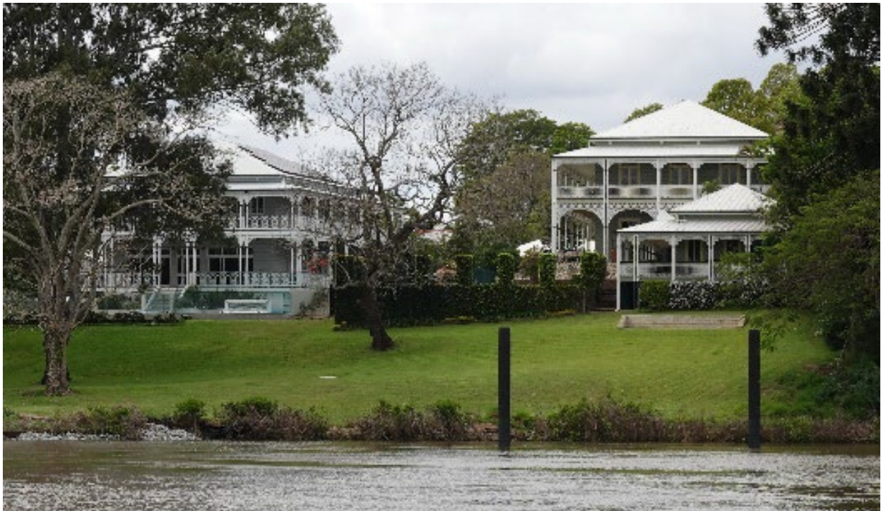
Houses along the bank.

After a leisurely start we wandered across the river to the Cultural Centre pontoon to catch the cruiser 'Miramar' for a wonderful cruise up the river, passing some of Brisbane's older and most exclusive homes.