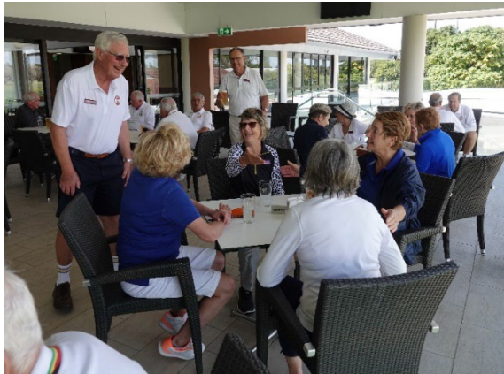
Drinks and snacks on the terrace.