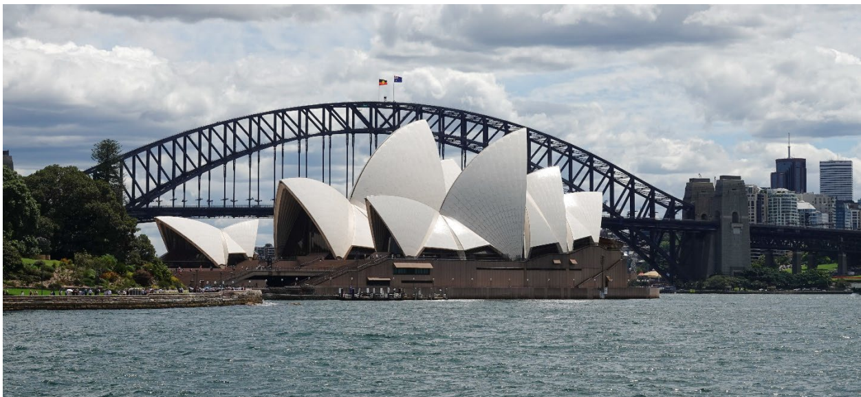
Sydney Opera House with Sydney Harbour Bridge in the background.

A free morning in Sydney, such a beautiful town with so much to enjoy. The Sydney Harbour Bridge and the Opera House so majestic in real life, they are breathtaking.